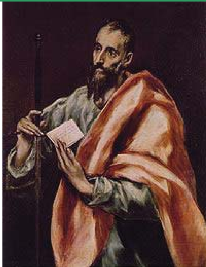
ST. PAUL OF TARSUS