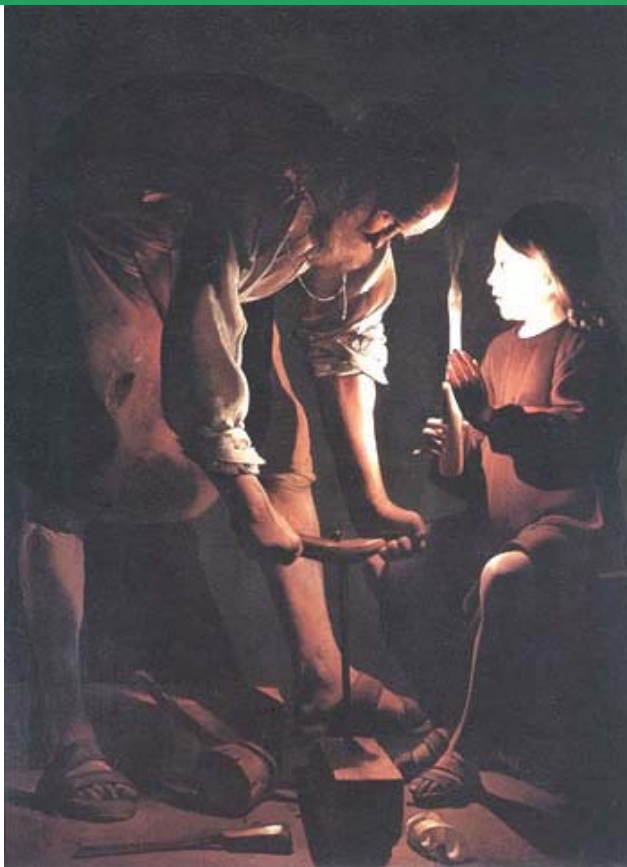
"Joseph the Carpenter and the Child Jesus" Georges de LaTour 1593-1652